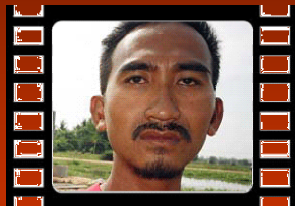
Sentenced Home (documentary)

What do a quizzical housecat and a homeless "grand master artist" have in common?