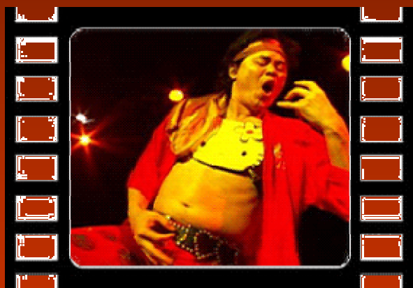
Air Guitar Nation (documentary)

Life of a former Pakistani rock star who now sells coffee from his push cart on the streets of Manhattan