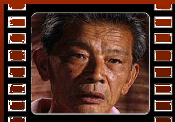
The Slanted Screen (documentary)

Why are there so few images of Asian American men in the media?