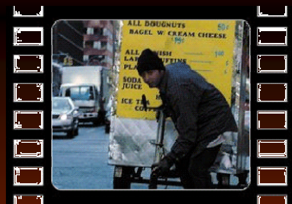
Man Push Cart (drama)

The Asian American Film Series is funded in part by the Anonymous Fund and the Asian American Studies Program at the University of Wisconsin-Madison. For more information about Asian American Studies at UW, a listing of film holdings on Asian Americans, and a downloadable list of film showing dates and times, go to http://polyglot.lss.wisc.edu/aasp/ .